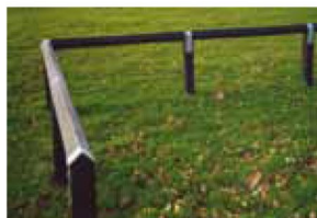
Birdsmouth/Trip Rail/Knee Rail

We can recommend an alternative fixing method where the posts can be drilled through into the rail. Rails are then secured by countersunk screws and caps.